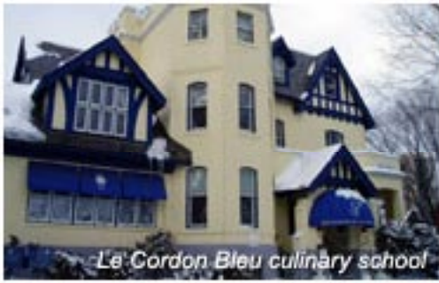
Le Cordon Bleu culinary school